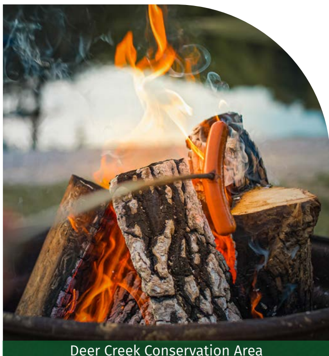
Deer Creek Conservation Area