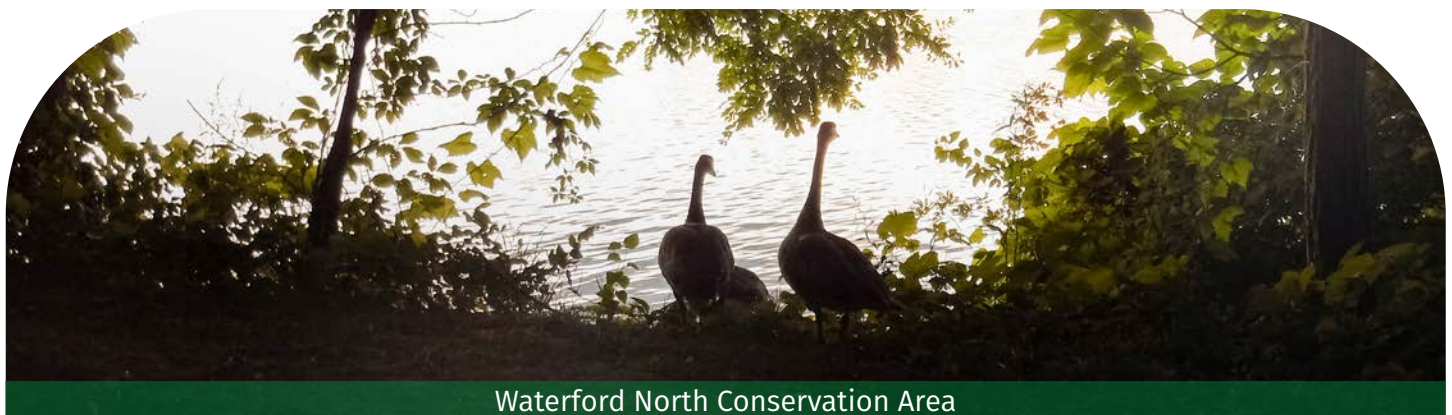
Waterford North Conservation Area