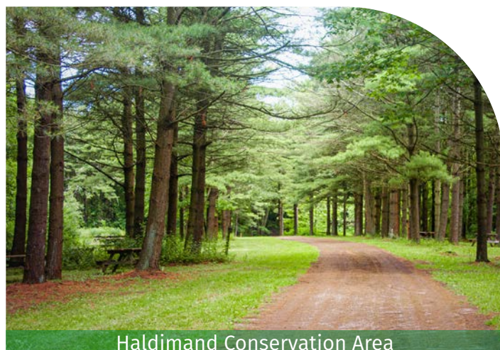
Haldimand Conservation Area