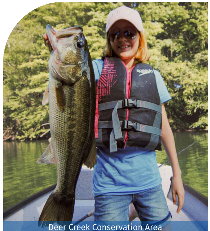
Deer Creek Conservation Area