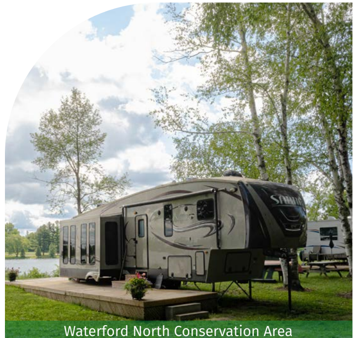
Waterford North Conservation Area