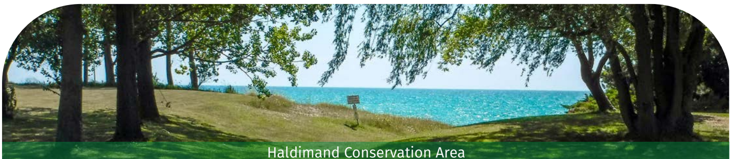
Haldimand Conservation Area